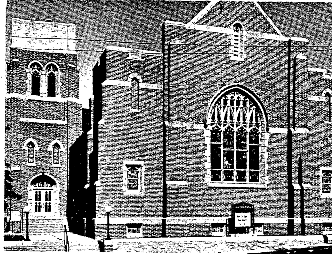
Located at the corner of Main and Center Streets, Mt. Wolf, Pa. — Rev. Paul E. Stambach, pastor

Otterbein Church Evangelical United Brethren offers study and training classes for all age groups. Study classes are held Sunday morning at 9:30 o'clock. Church services are held Sunday morning at 10:35. Youth Fellowship for all school age children meets Sunday evening at 6:30.